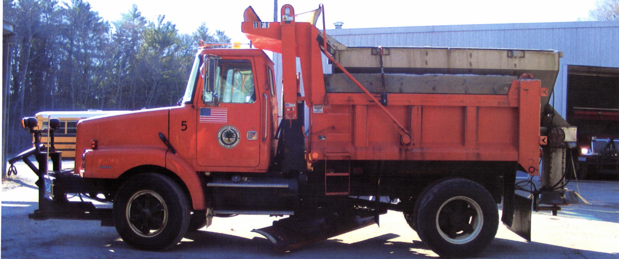
Unit #5 1999 Volvo Dump Truck / With Plow & Sander