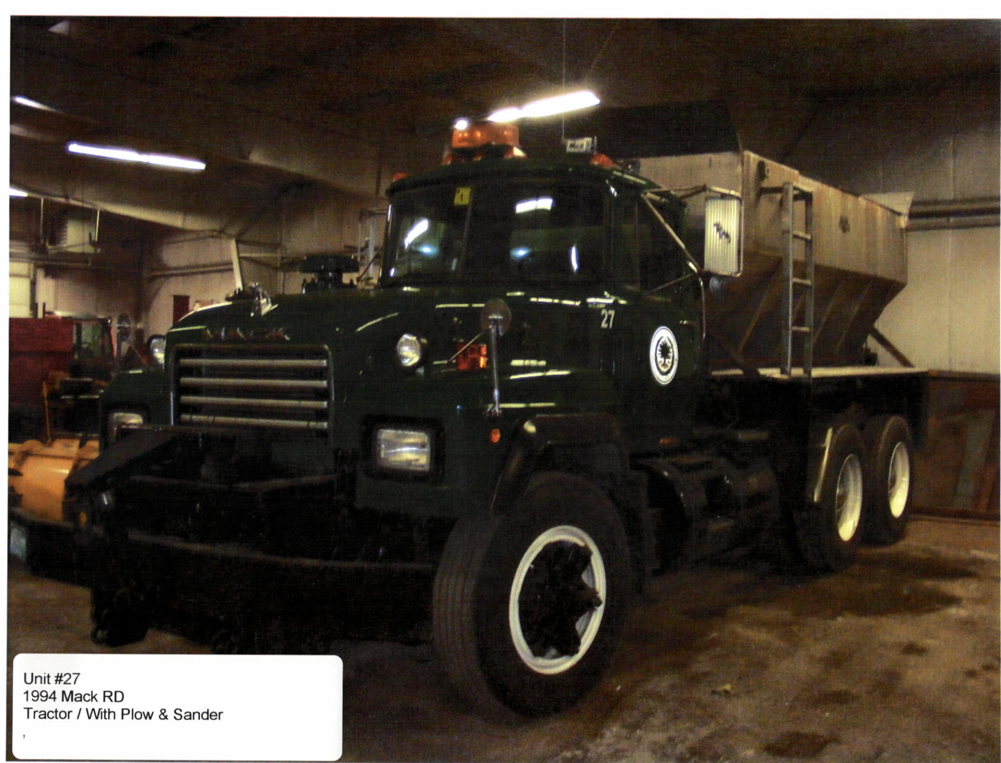
Unit #27 1994 Mack RD Tractor / With Plow & Sander