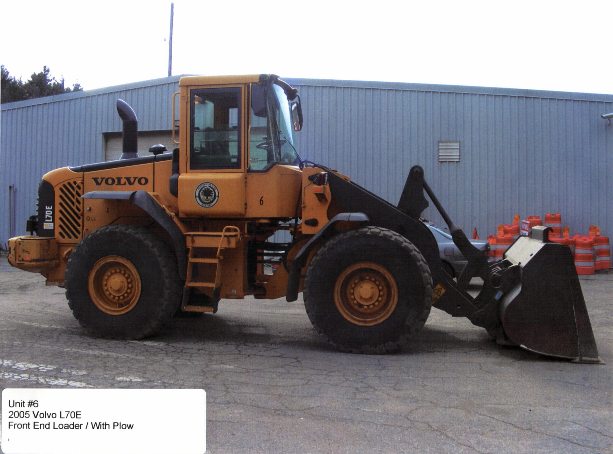
Unit #6 2005 Volvo L70E Front End Loader / With Plow