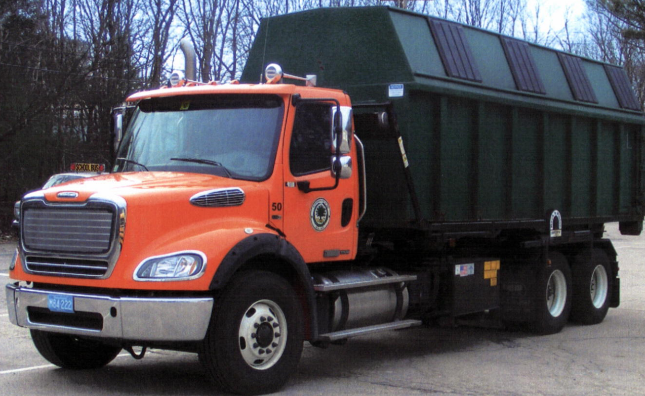
Unit #50 2010 Freightliner Roll Off