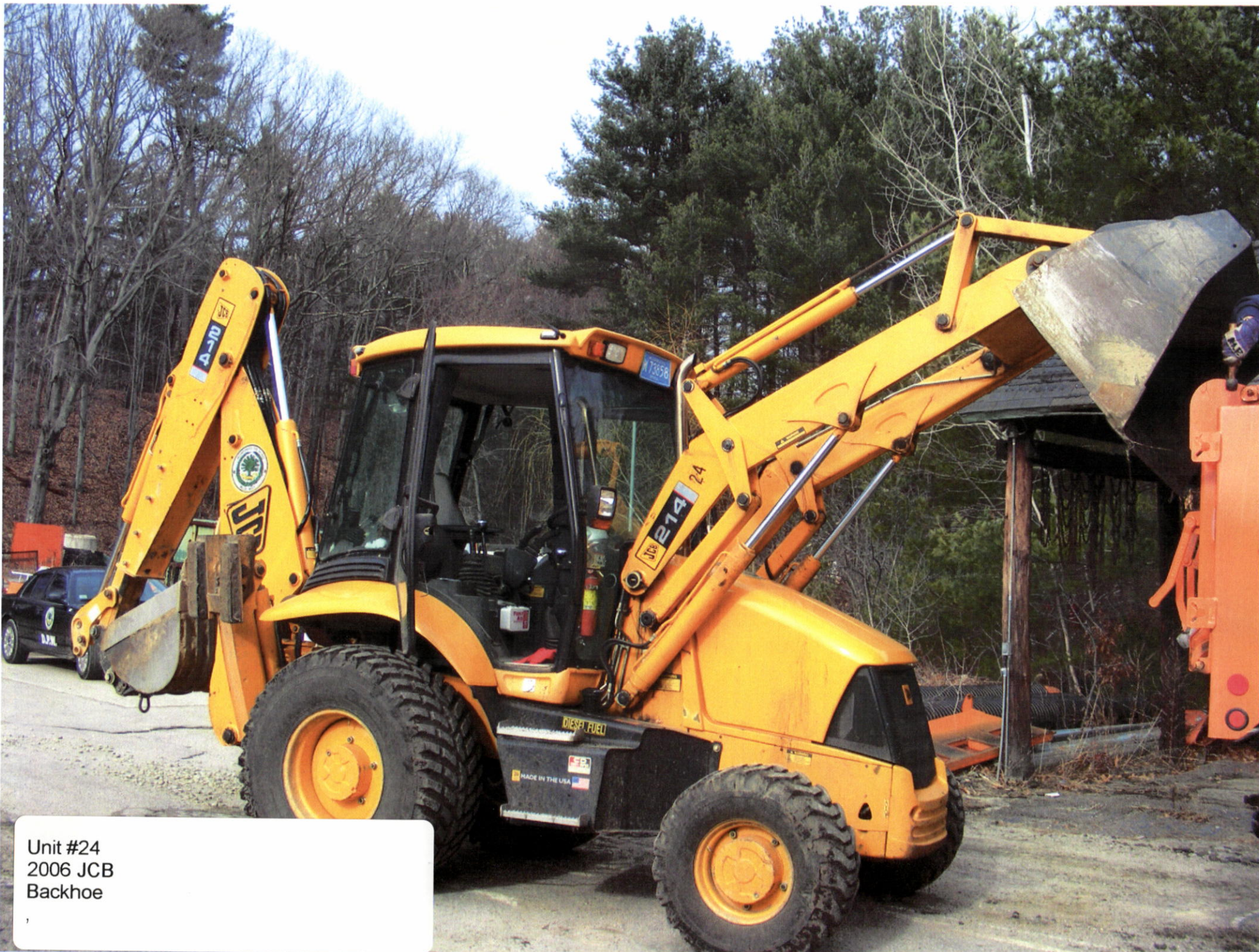
Unit #24 2006 JCB Backhoe