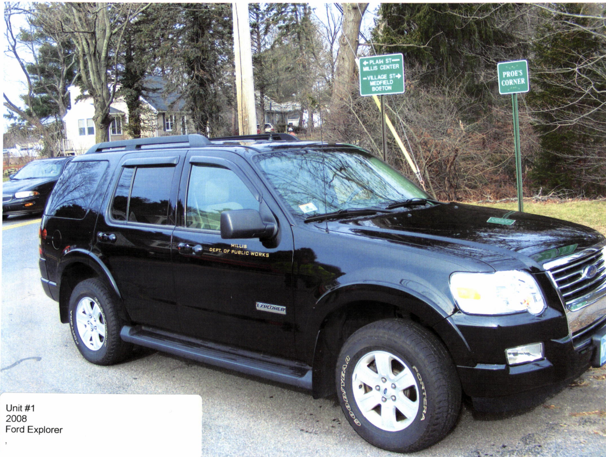
Unit #1 2008 Ford Explorer