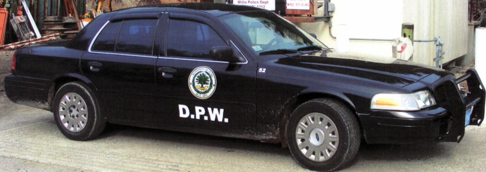
Unit #52 2004 Ford Crown Victoria Meter Reading