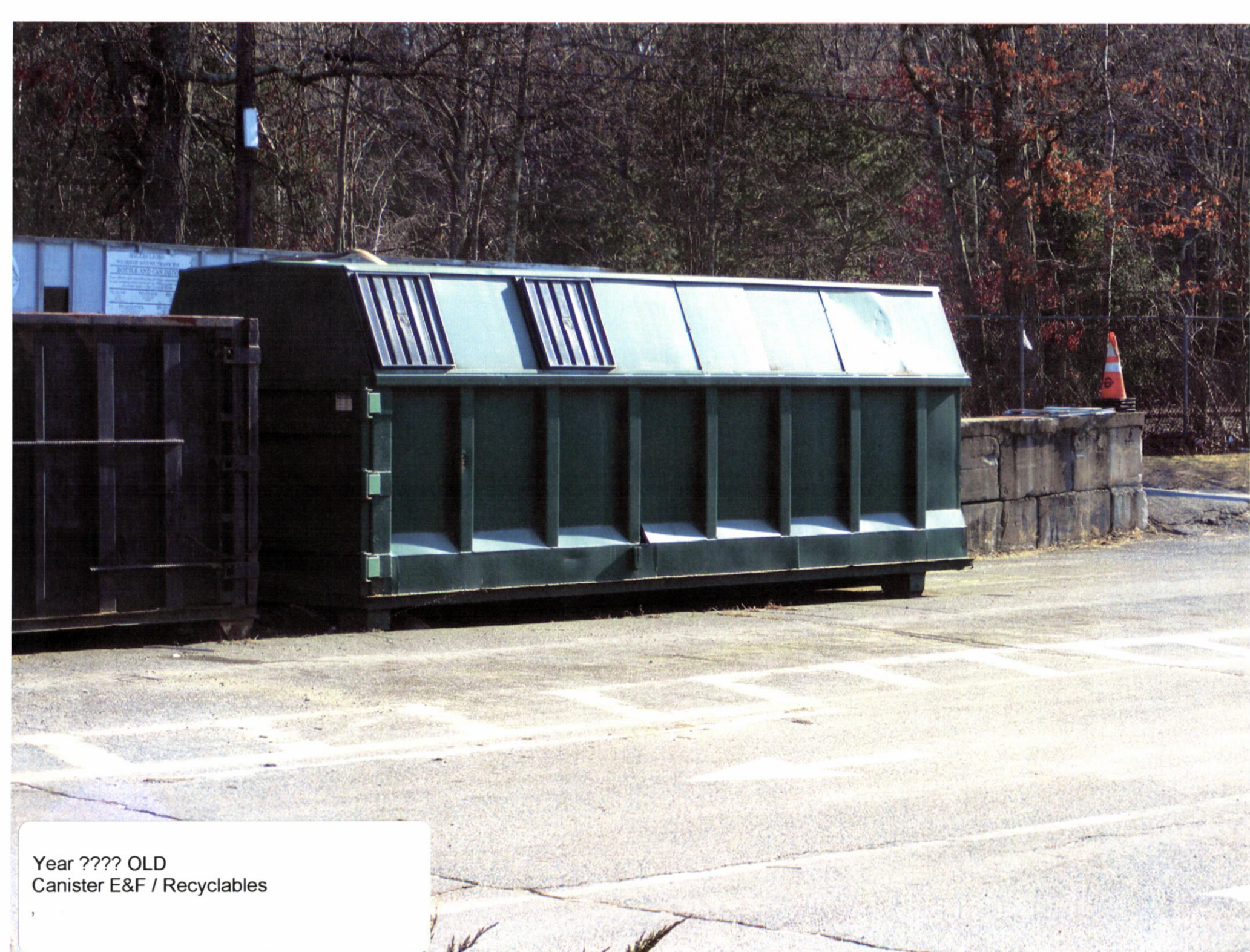
Year ???? OLD Canister E&F / Recyclables