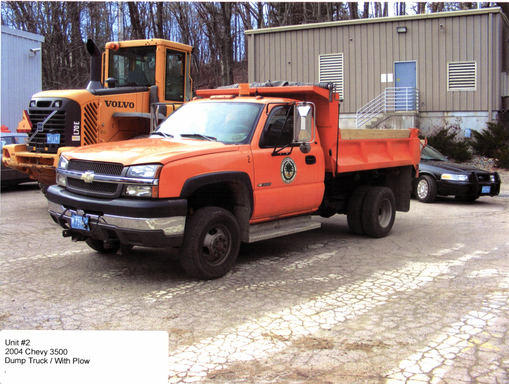
Unit #2 2004 Chevy 3500 Dump Truck / With Plow