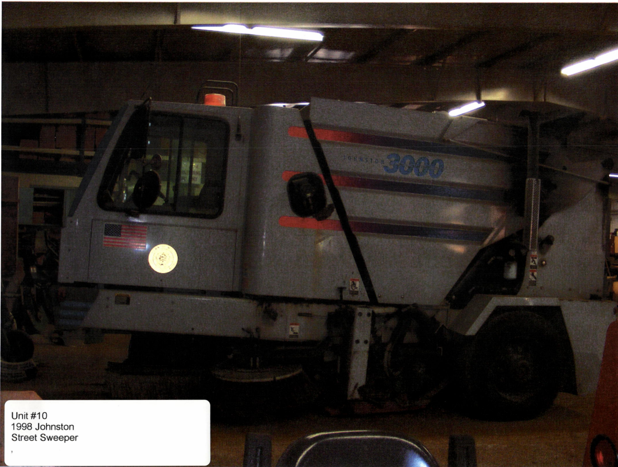
Unit #10 1998 Johnston Street Sweeper