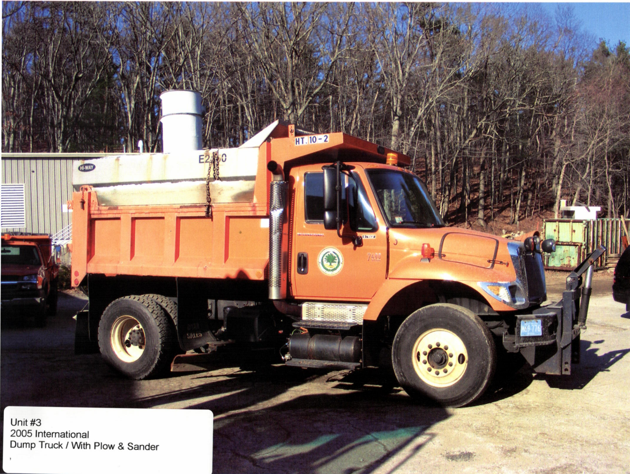
Unit #3 2005 International Dump Truck / With Plow & Sander