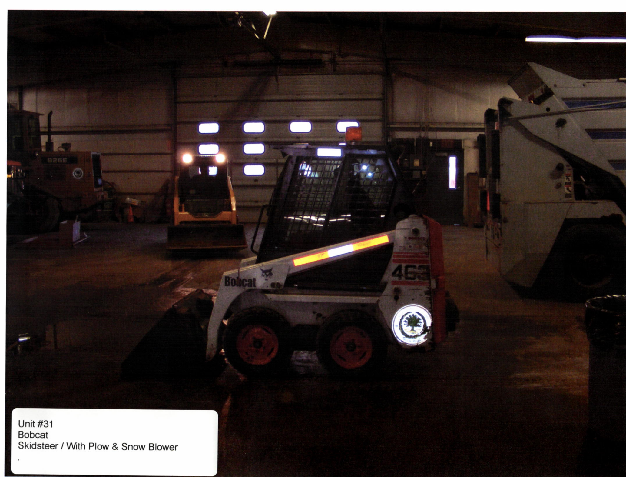
Unit #31 Bobcat Skidsteer / With Plow & Snow Blower