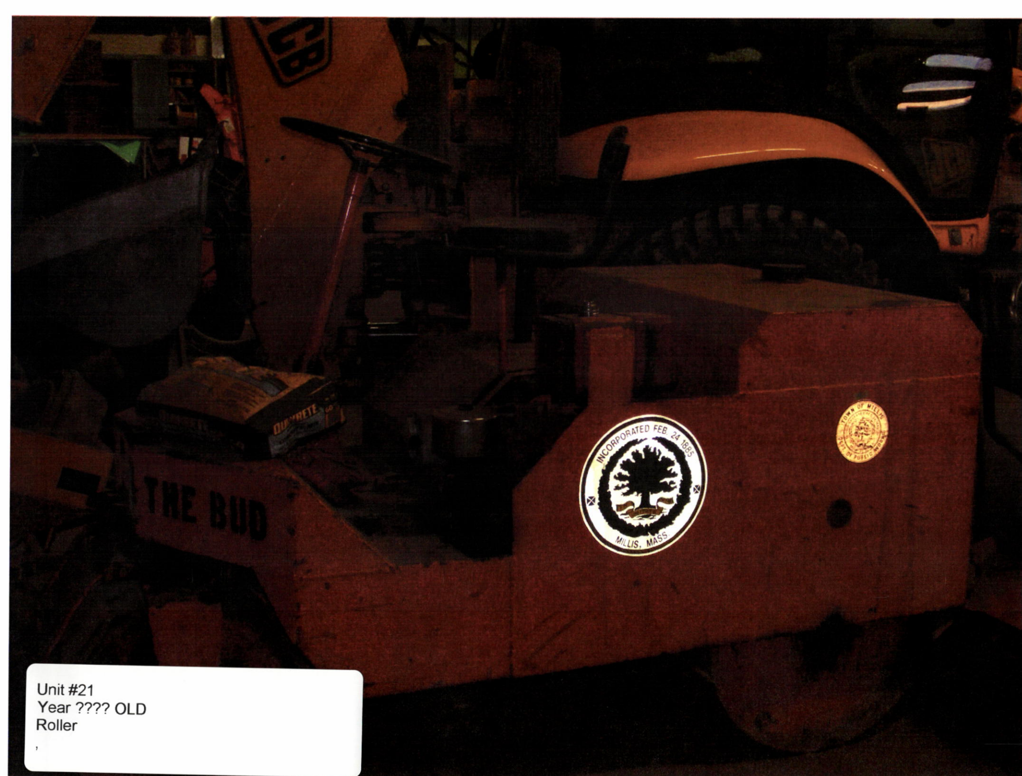
Unit #21 Year ???? OLD Roller