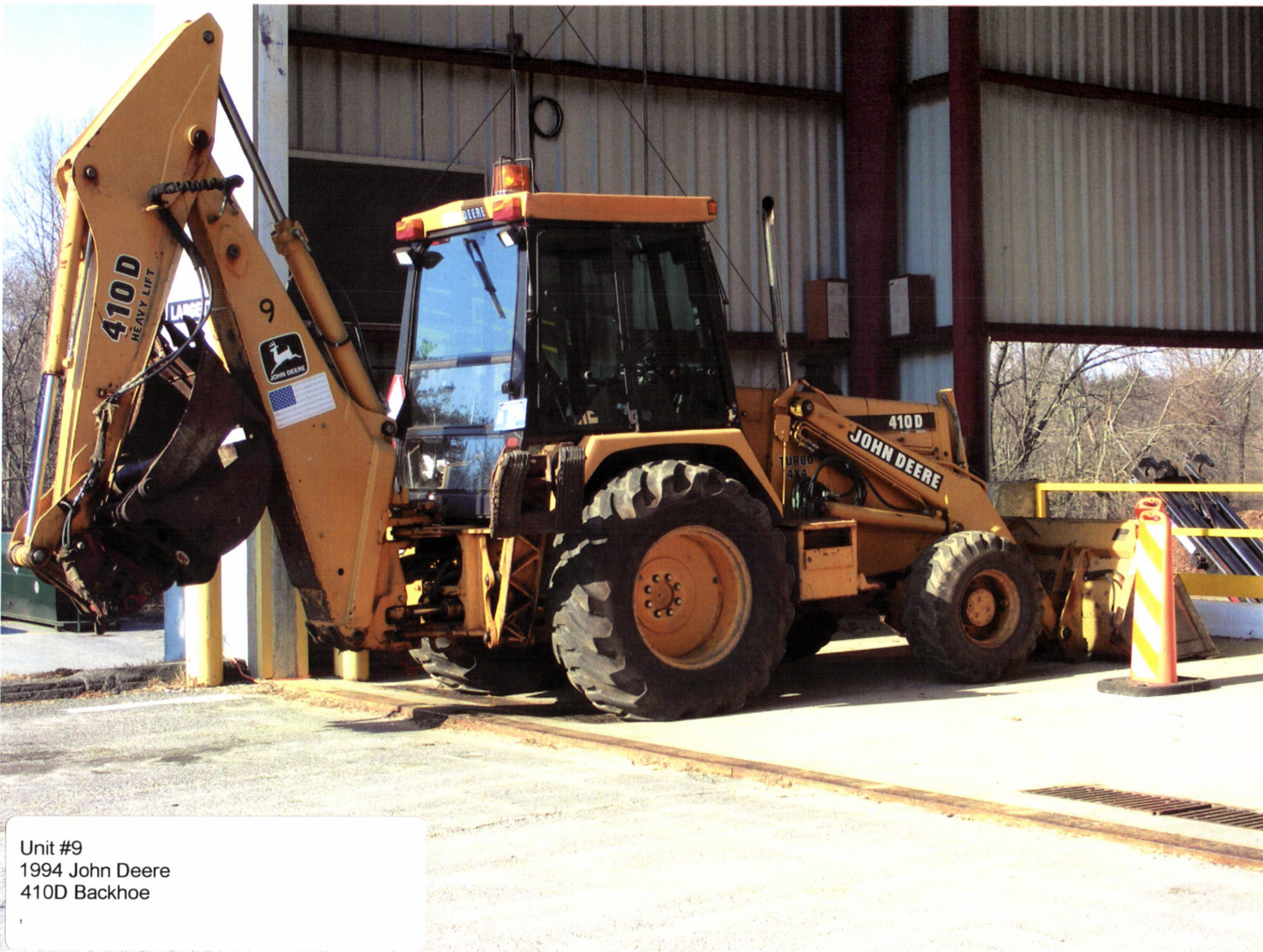
Unit #9 1994 John Deere 410D Backhoe