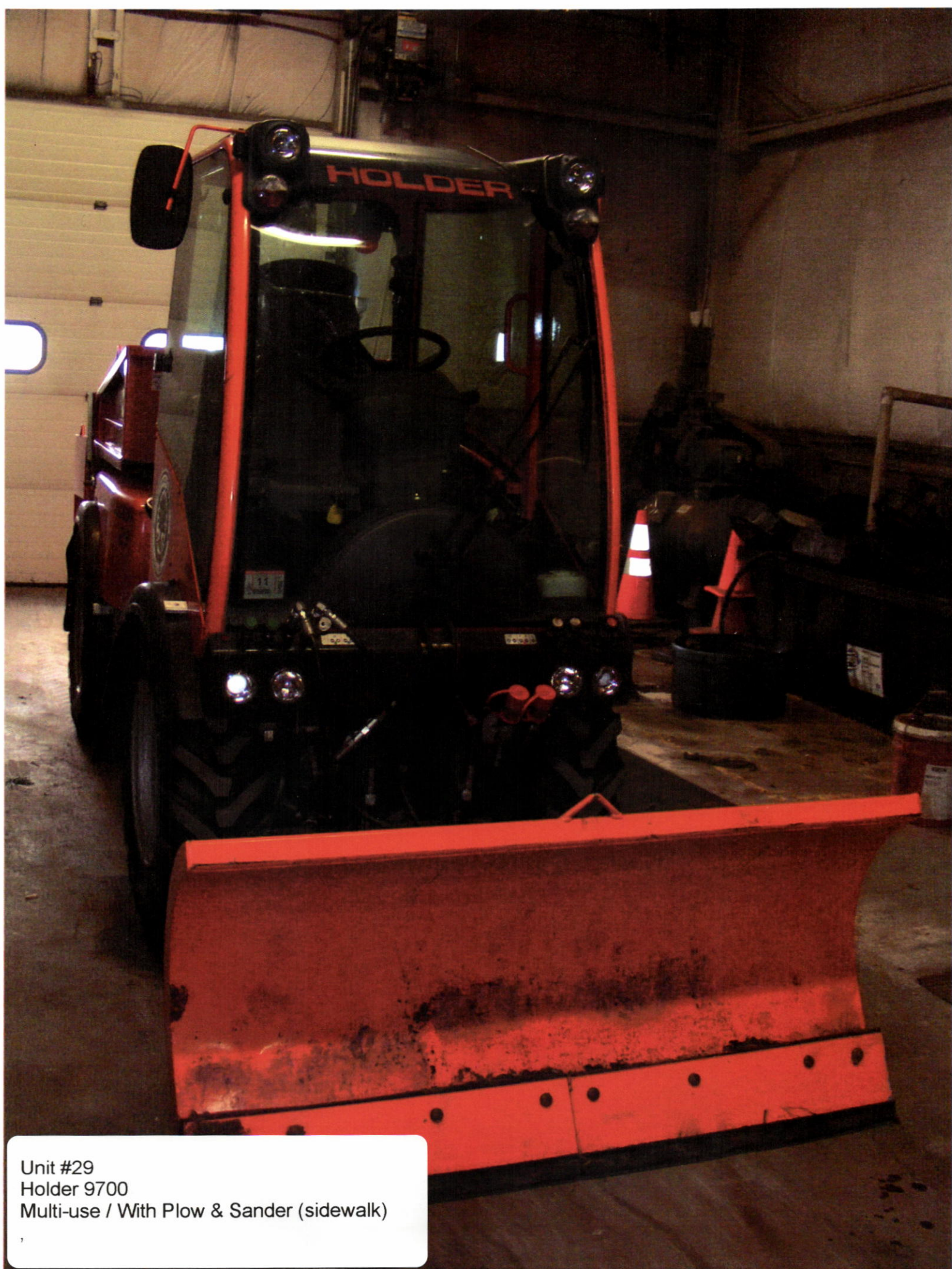
Unit #29 Holder 9700 Multi-use / With Plow & Sander (sidewalk)