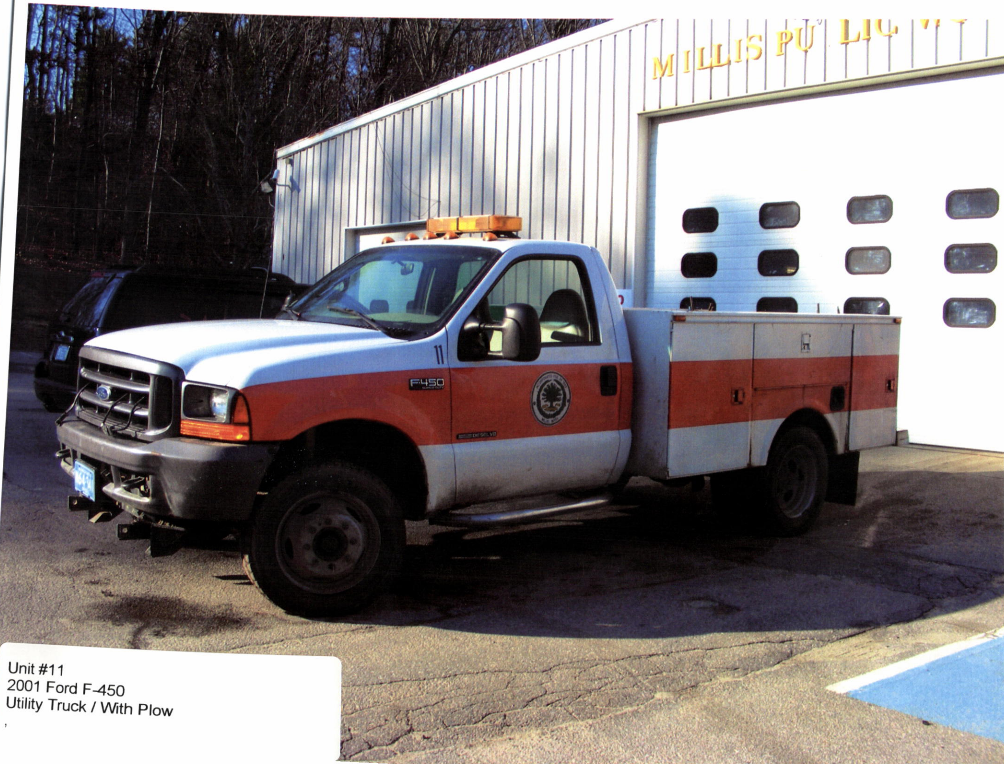
Unit #11 2001 Ford F-450 Utility Truck / With Plow