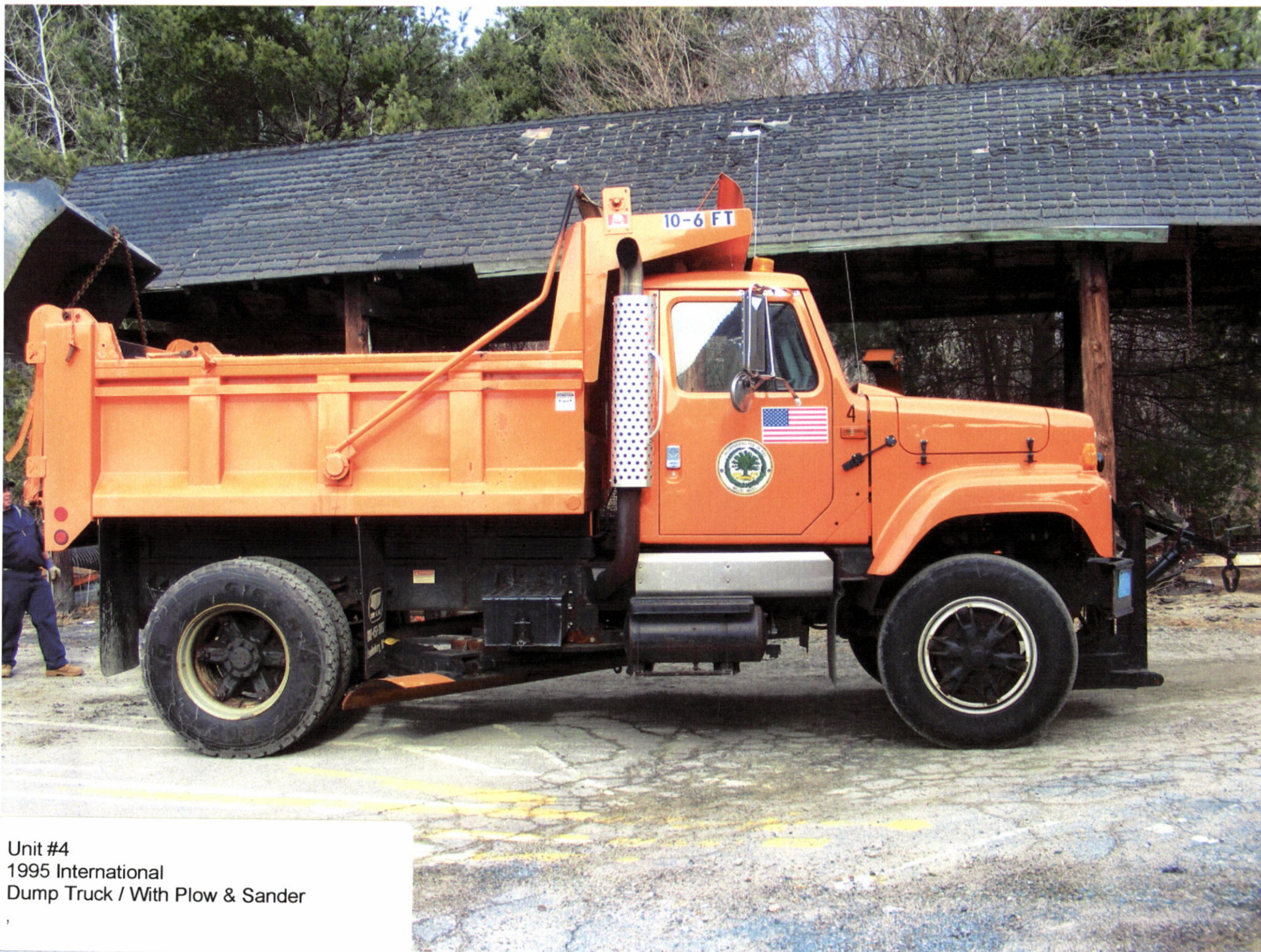
Unit #4 1995 International Dump Truck / With Plow & Sander