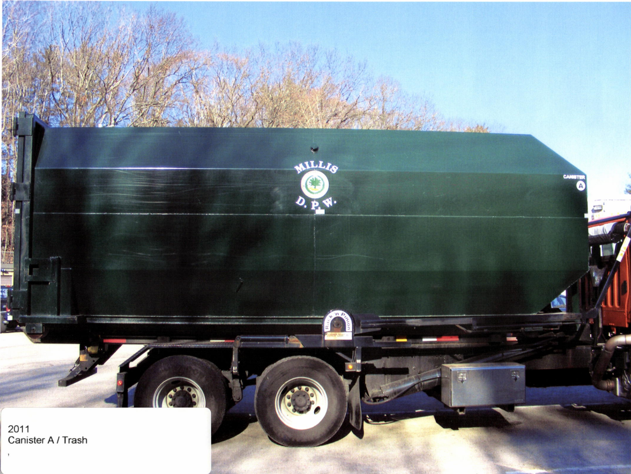
2011 Canister A / Trash