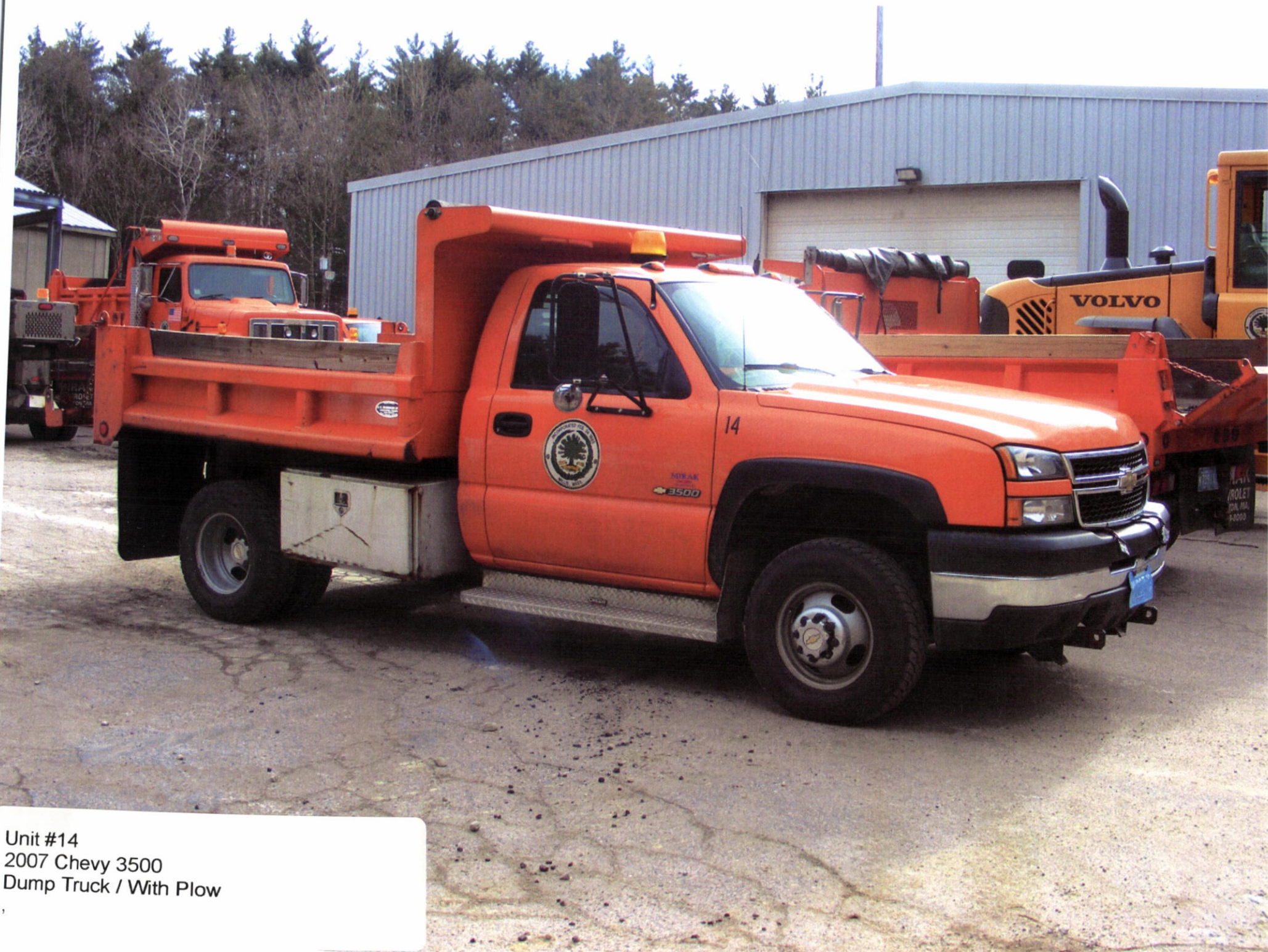
Unit #14 2007 Chevy 3500 Dump Truck / With Plow