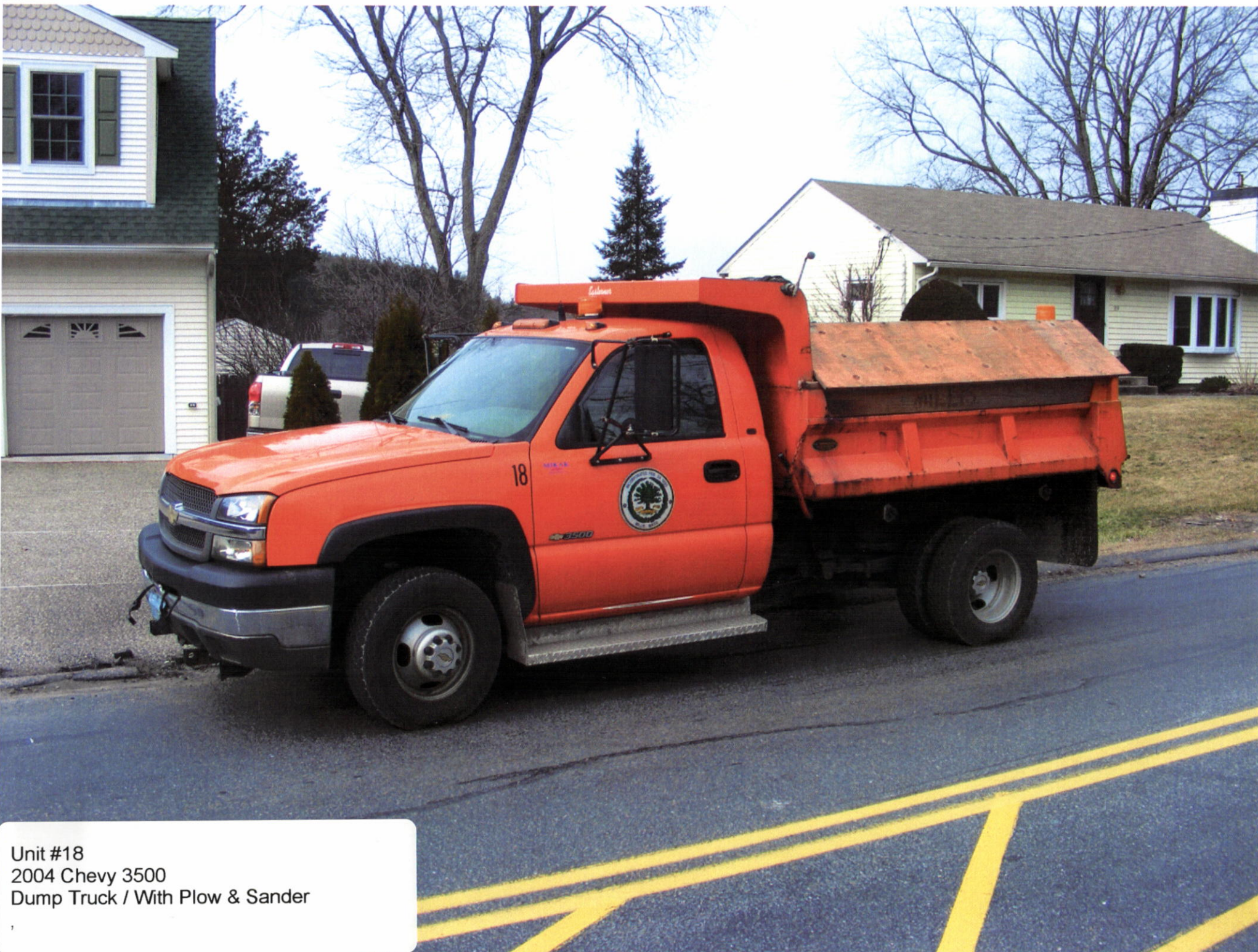
Unit #18 2004 Chevy 3500 Dump Truck / With Plow & Sander