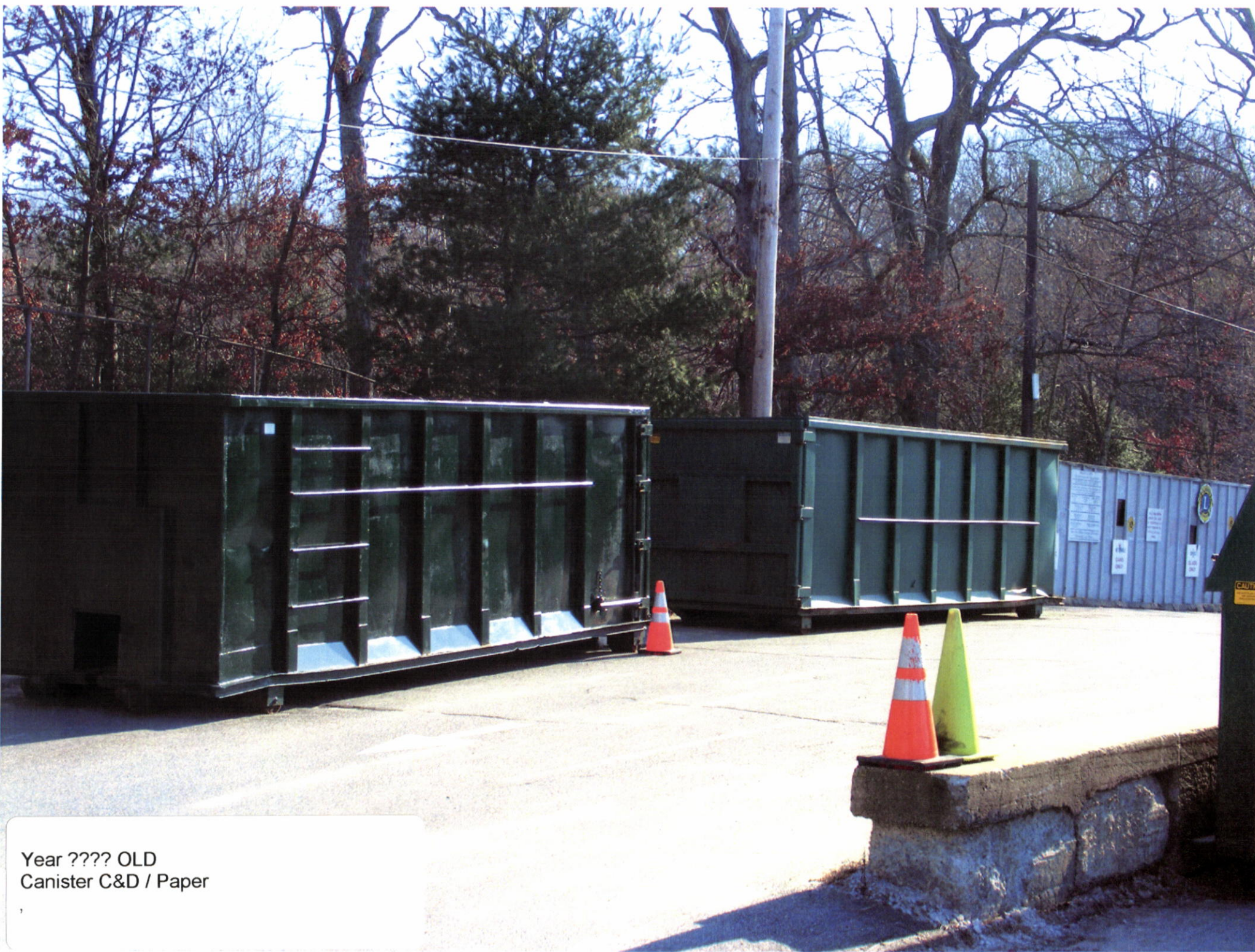
Year ???? OLD Canister C&D / Paper