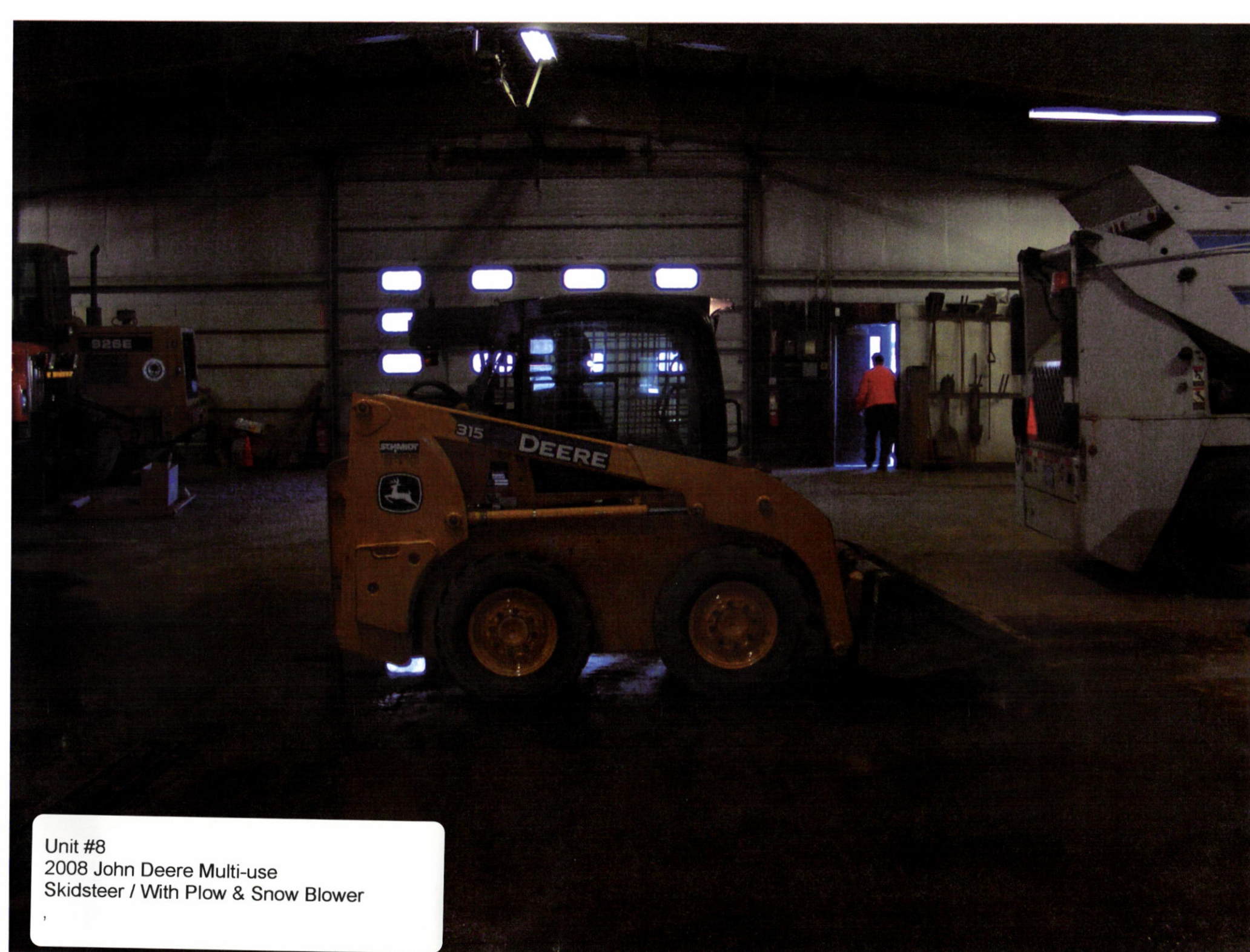
Unit #8 2008 John Deere Multi-use Skidsteer / With Plow & Snow Blower