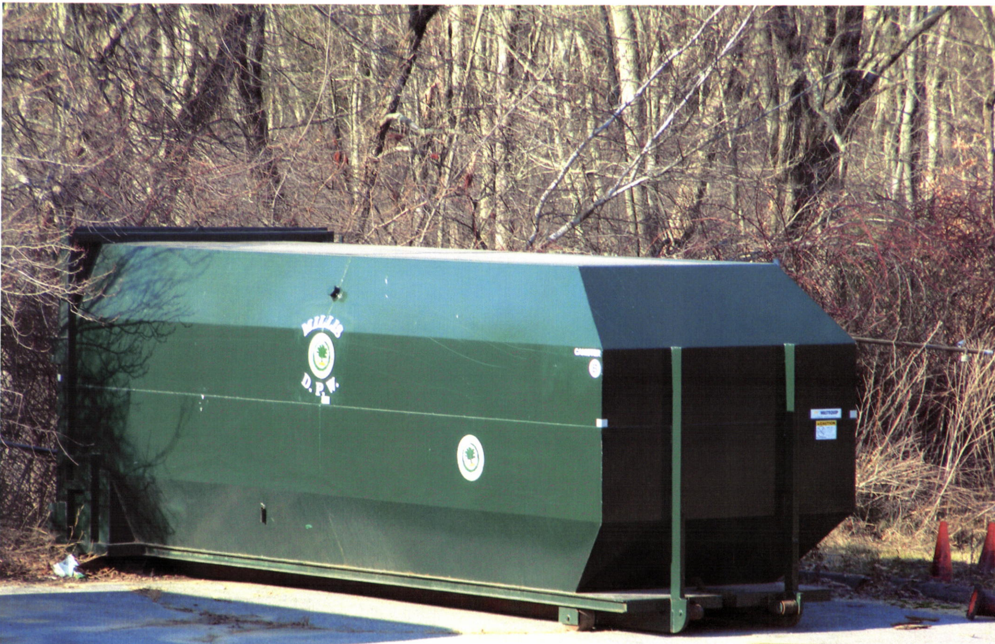
2011 Canister B / Trash