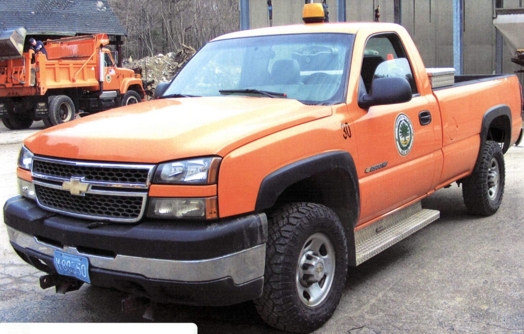
Unit #30 Chevy 2500 Pickup / With Plow